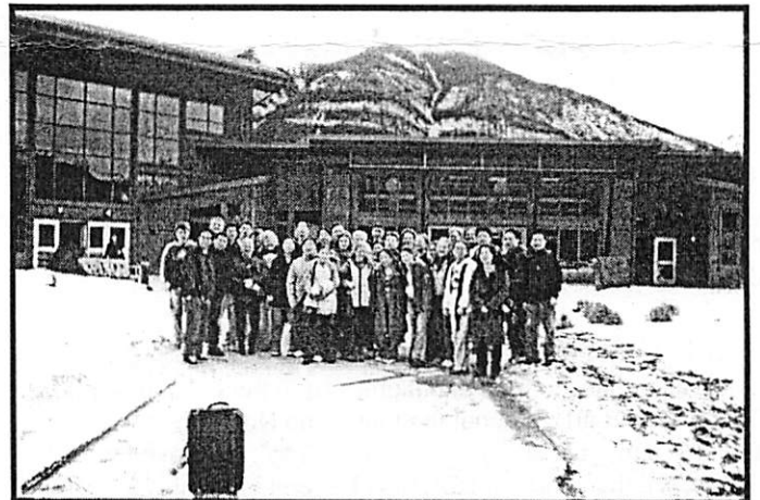
Cellofest #5 – Banff, February 2003