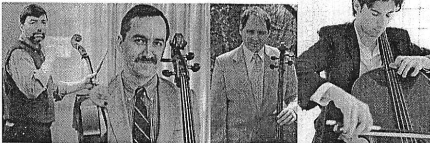
Three Concerti, Three Etudi:

Save your place. Pre-registration and information e-mail: lusion@earthlink.net or telephone: 703-351-7852