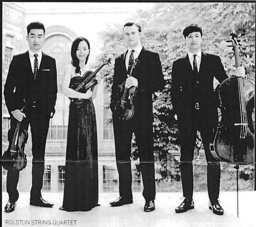
ROLSTON STRING QUARTET